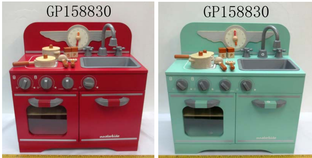
PHOTOGRAPH(S) OF THE SAMPLE